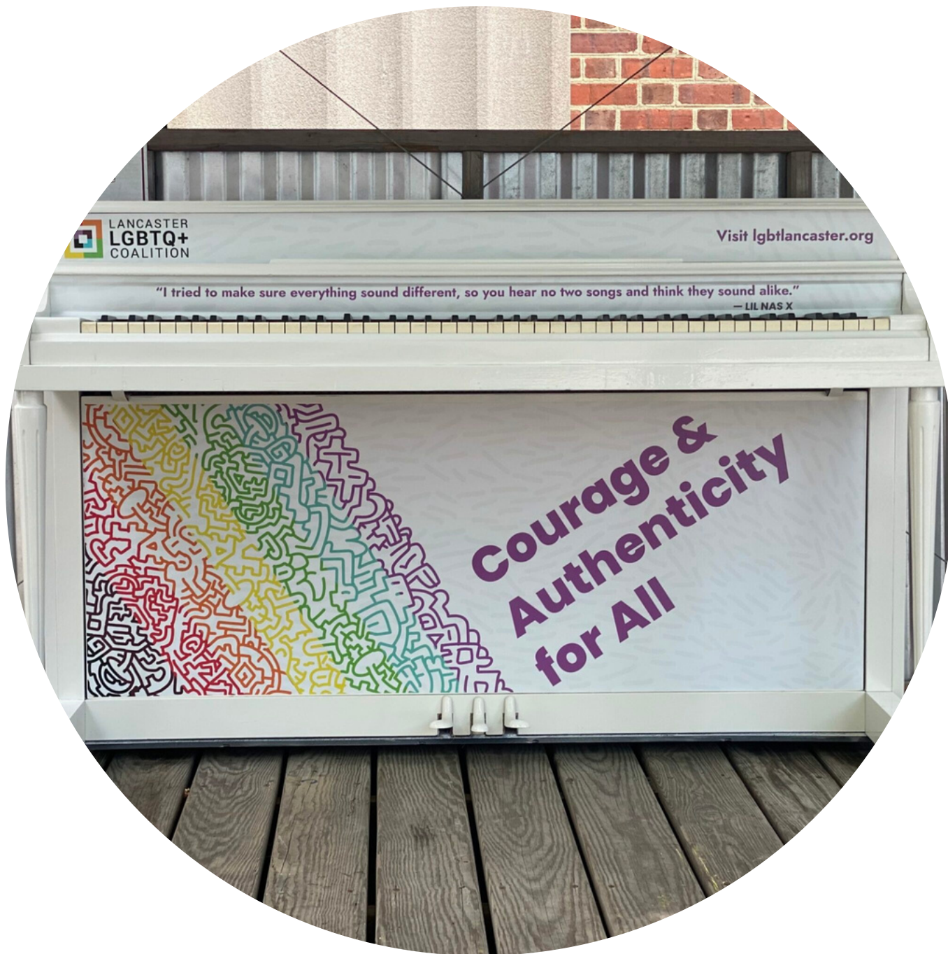
Music For Everyone Lancaster, PA